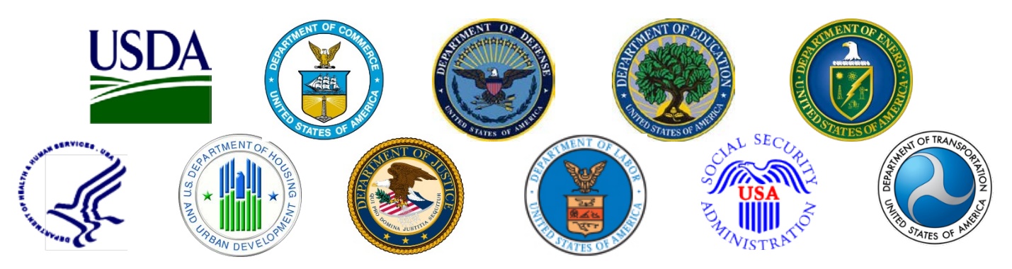
April 28, 2016